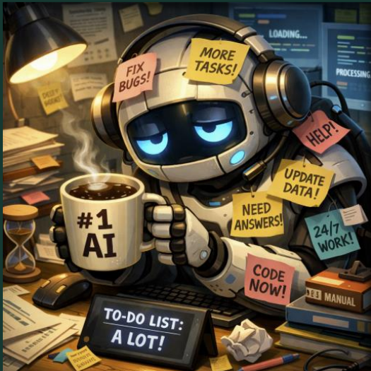
“The overworked intern”