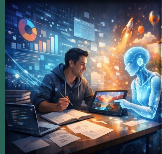
“Exploring and growing together”