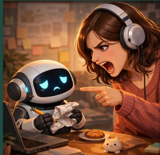
“Do what I mean, not what I say”